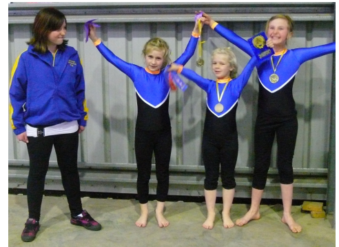
Blue Lake Invitational Gymnastics Competition in Mt Gambier