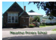
Macarthur Primary School

There will be 'Working Bee's' at the pool Tue 16 th Wed 17 th & Thur 18 th Nov. commencing 6pm to clean-up the area and paint slide tower. Your support would be appreciated.