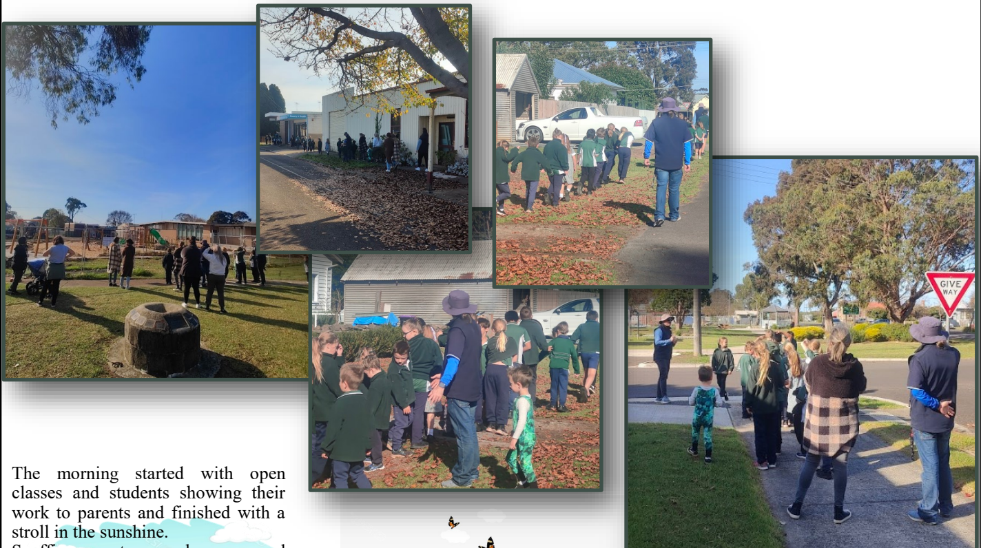
The morning started with open classes and students showing their work to parents and finished with a stroll in the sunshine. Scuffing autumn leaves and checking out the new playground in Market Square were popular activities