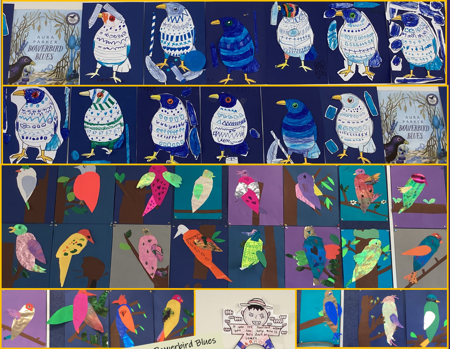
MARC works with Mrs Templeton - Bowerbird Blues Art with Mrs Down - Bird In a Tree MARC - Harmony Day